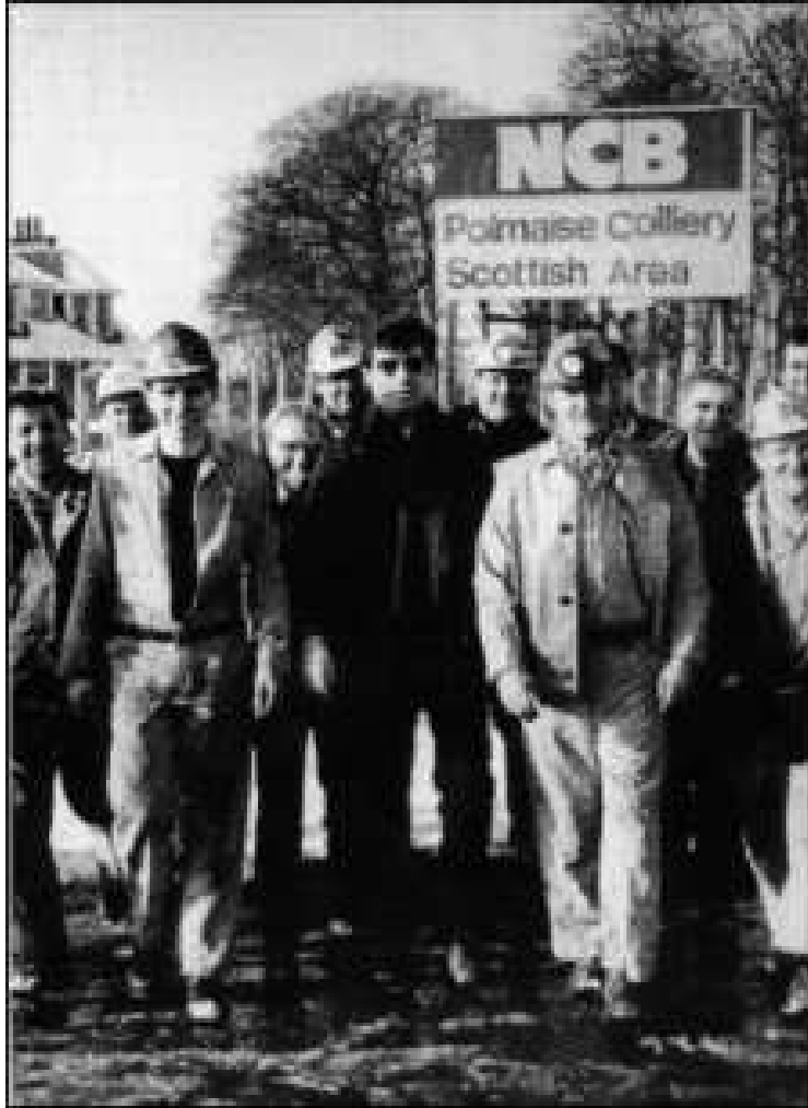
Miners from Polmaise Colliery