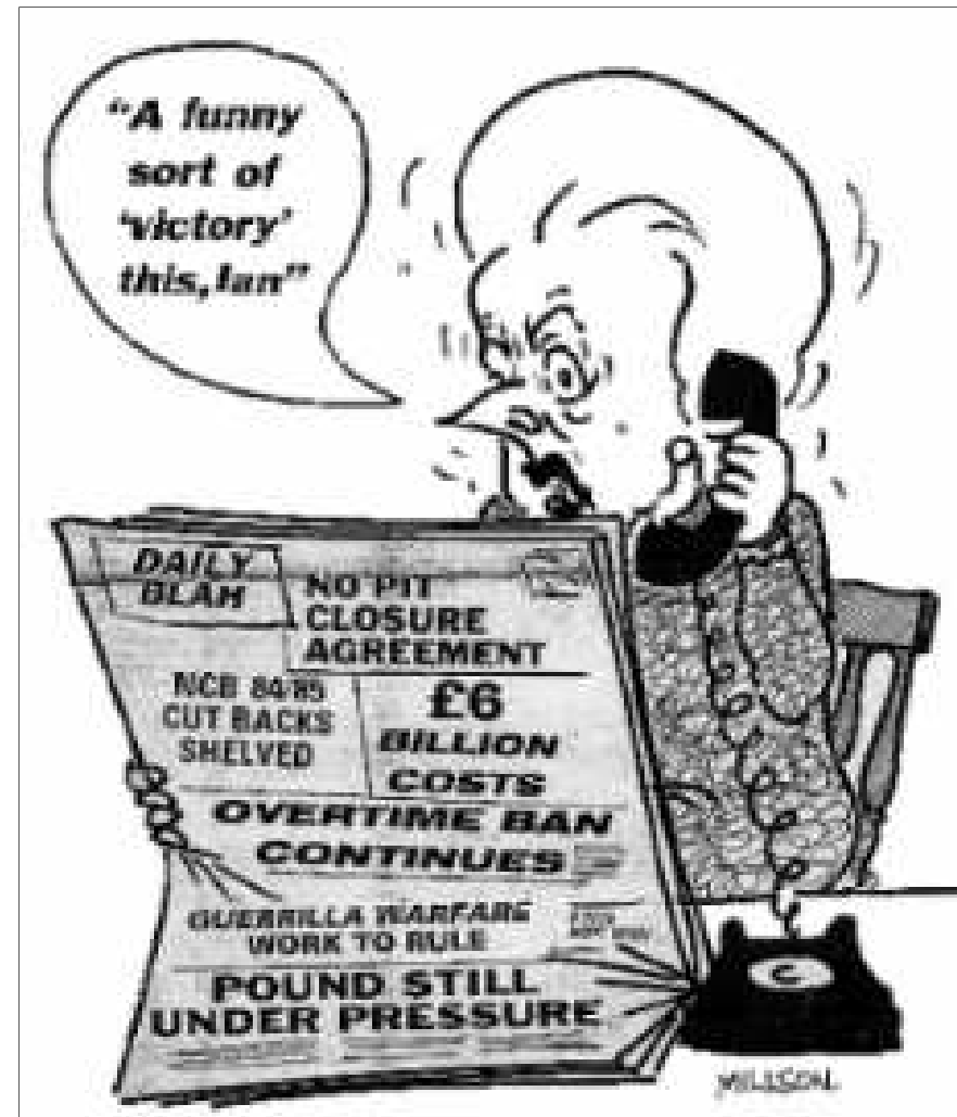
From 'The Miner Special Issue' Thursday March 7th 1985

The subject is still one fiercely debated with no neat historical perspective. To make your own judgements read the information which follows.