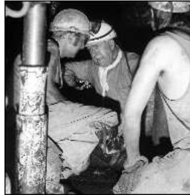
Ian MacGregor, NCB Chairman

Miners working for the National Coal Board saw this as a direct threat to the security of their jobs, either in the short or longer term. Therefore, in March 1984, when the NCB announced its plans to close Cortonwood colliery in South Yorkshire and Polmaise colliery near Alloa, local strikes were