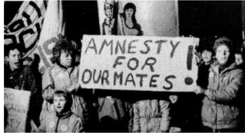
Campaigning for the reinstatement of sacked miners.